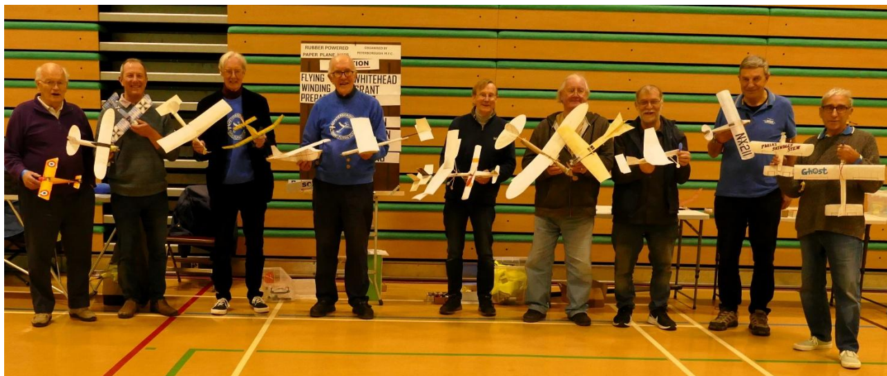
The competitors line up with a sheaf of model planes – all made of paper

With generous sponsorship from the BMFA's East Anglia Area, Peterborough MFC were able to plan and run the National Indoor Paper Plane event on the 2 nd March at the Bushfield Leisure Centre in Peterborough. Over 40 people came to the event with 9 entries in paper plane duration and 6 entries in paper plane scale.