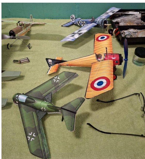
Some amazing creations – all from paper

To ensure good numbers at the event PMFC had also organised more traditional indoor fare such as traditional rubber scale, Hanger Rat and sport flying. The indoor scale community also took the event as an opportunity to trim for the FF Indoor Nats in April and so we were treated to some spectacular model flying.